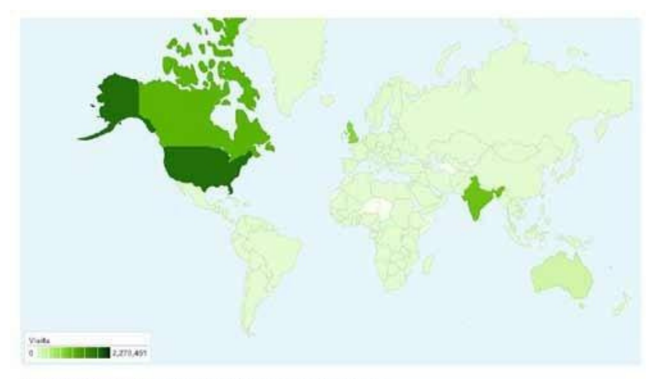
6,996,009 visits came from 224 countries/territories